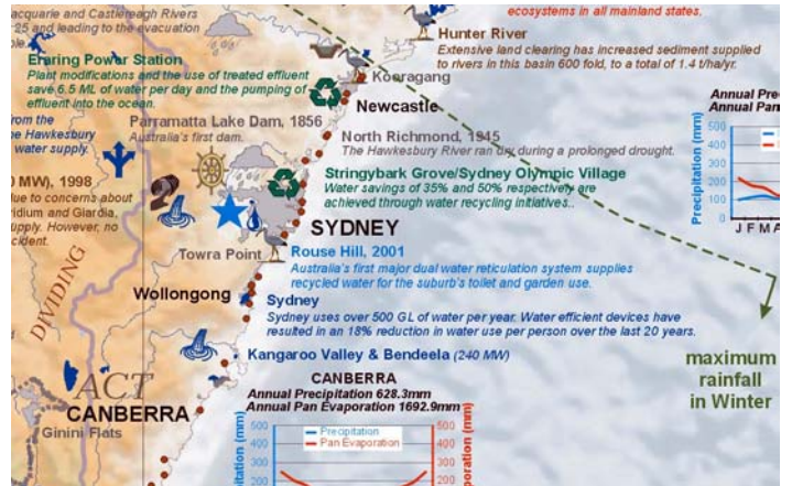
Spatial Data on The Australian Water Map, 2003

The aim of the environment maps is to convert environmental data into environmental information that is innovative and creative, whilst remaining accurate and representative of the state of the environment. The maps bring together vast and wide ranging environmental data into a single resource that is factual and easily accessible and, importantly, visually appealing.